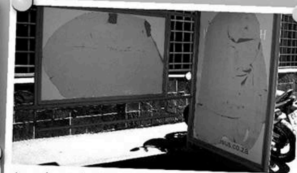
A severely vandalised bus shelter

It was thrilling for me to be doing street evangelism on New Year's day. Our team went to Camps Bay beach to hand out water again. The beach was full of people and we engaged in several conversations. One Jewish man came out of a restaurant and began waving enthusiastically at me. He was from New York and had seen Jews for Jesus around there a lot and wanted to know what we did. He had never heard anything about Jesus before and was interested in knowing more. He was amazed at our generosity of providing him with free literature and really happy to have spoken to us. We were also able to pray for a woman