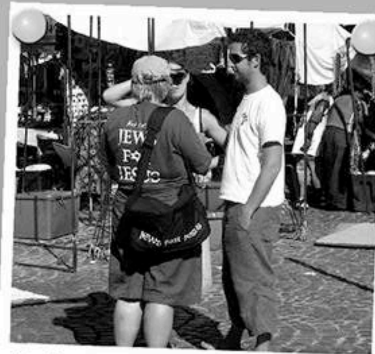
Gospel conversation at Greenmarket Square

As I passed out gospel tracts at a cricket match, a couple approached me with loud insults. I was feeling shaken and soon after, a big group of Jewish believers passed by and said, "Wow, Jews for Jesus! Praise the Lord!"