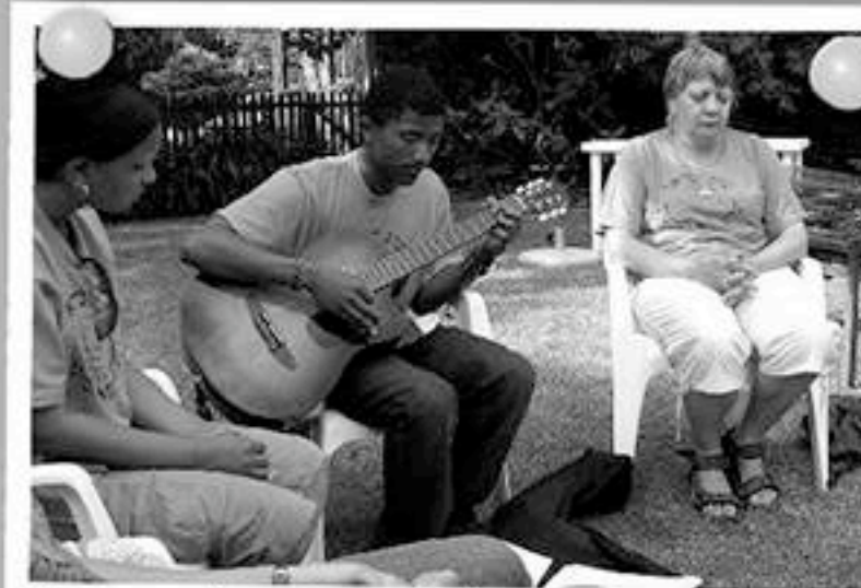
Praise, worship and prayer before going out in the mornings