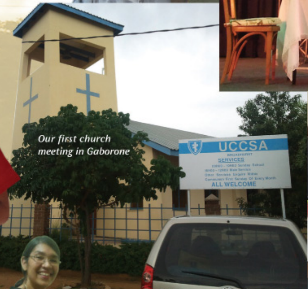
Our first church meeting in Gaborone