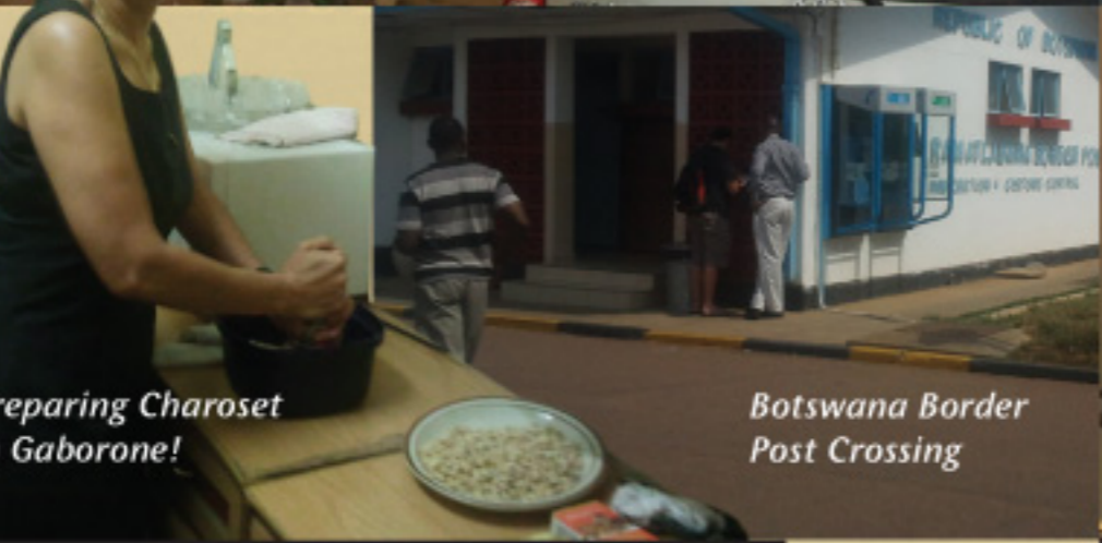
Preparing Charoset in Gaborone!