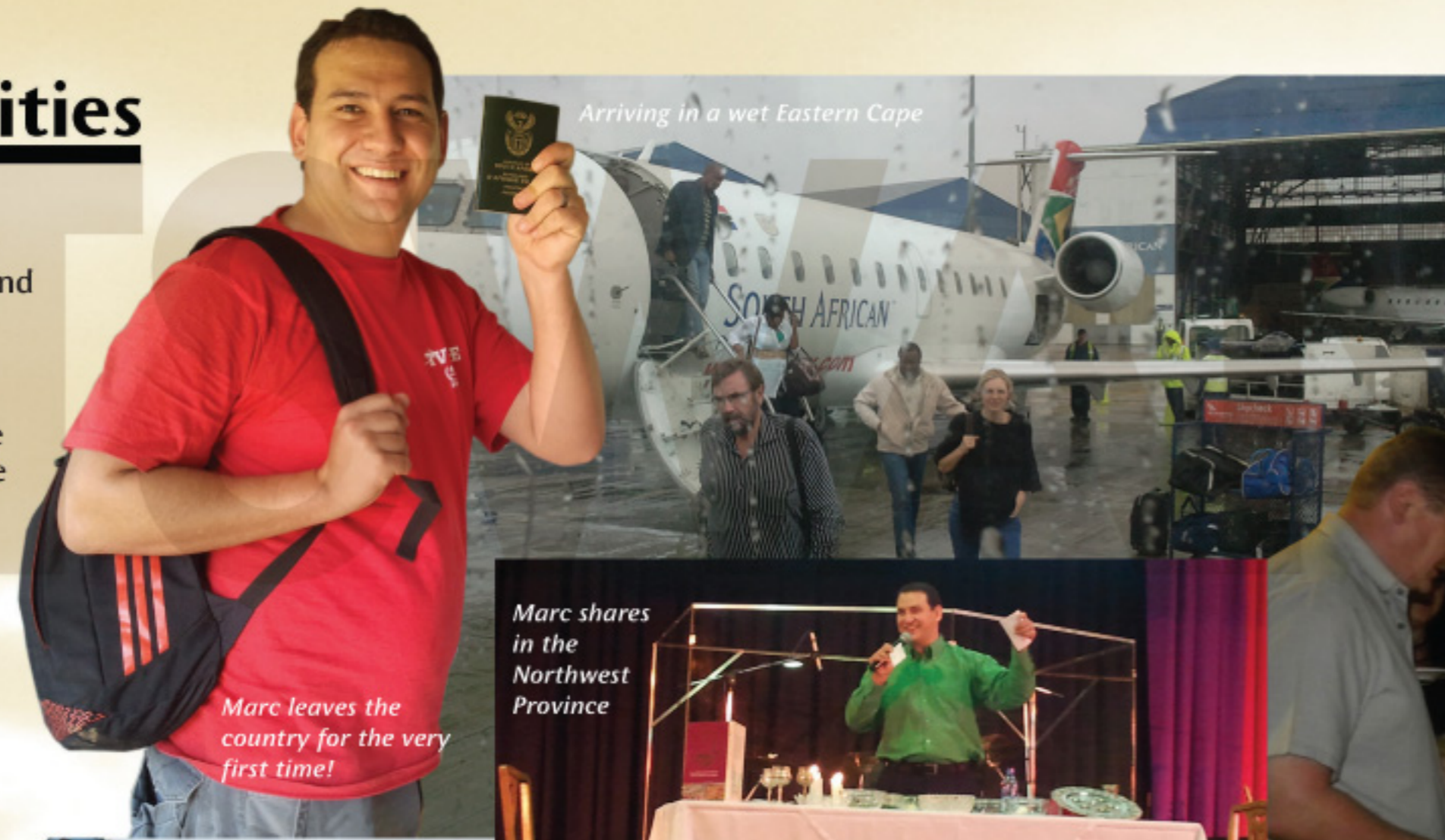
Arriving in a wet Eastern Cape